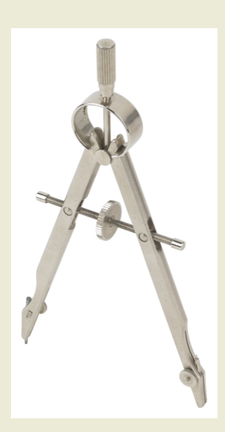
The Tax Cuts and Jobs Act, signed into law in December 2017, doubled the gift and estate tax basic exclusion amount and the GST tax exemption to $11,180,000 in 2018. They are $12,920,000 in 2023. After 2025, they are scheduled to revert to pre-2018 levels and cut by about one-half.

are met, however, a transfer to a qualified domestic trust (QDOT) will qualify for the marital deduction.